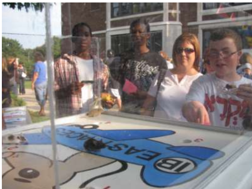
Tension and excitement mount as one of the mice spies hole number 3